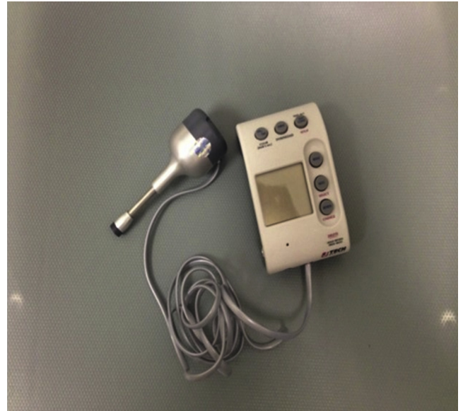
Figure 2. Algometer used for measuring pain pressure threshold (Tech Medical, Salt Lake City, UT).

Secondary outcomes included range of motion (ROM) which was determined in 3 planes of movement (flexion/extension, side bending, and rotation) using the Deluxe Cervical Range of Motion Instrument (CROM), model 12-1156 (Fabrication Enterprises, White Plains, NY). A ratio of measures of ROM over the normal range was determined for the left and right sides. The asymmetry was evaluated at baseline and at the end of treatment (3 weeks). Two additional measures of pain included a measure of pain pressure threshold (PPT) and the Brief Pain Inventory (BPI) [15]. PPT was obtained at 4 sites, following a standard procedure for assessing relative comparisons among the anatomical sites using a pressure algometer (Commander Algometer, Tech Medical, Salt Lake City, UT; http://www.jtechmedical.com/Commander/commander-algometer ) (Figure 2). Subjects were instructed to identify the moment at which symptoms underwent a qualitative shift from pressure to pain during algometer compression. The reading at that time was determined to be the PPT score. A high